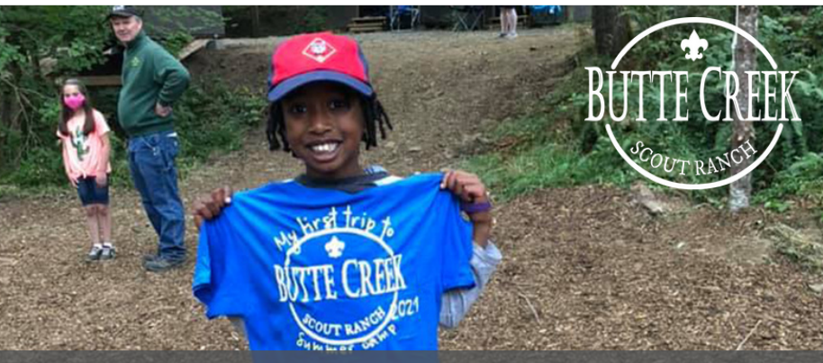
See the rebuilding of our Ranch after the 2020 wildfires at cpcbsa.org/rebuild

Meanwhile, generous donors supported a year of rebuilding and adventure for more than 6,000 camp attendees.